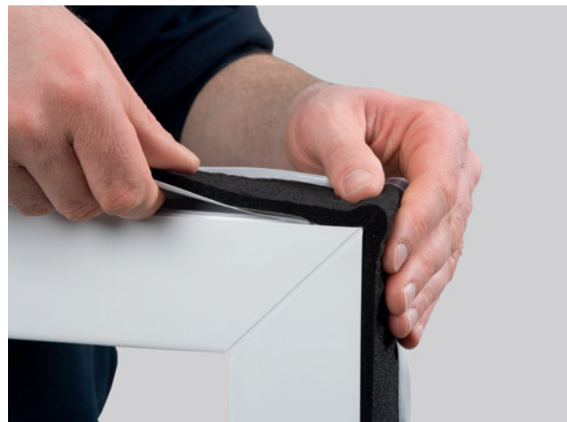
Installation example: ISO-BLOCO ONE

*** Movement in structural elements and temporary longitude changes are to be taken into account by the max. joint width.